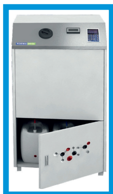
Automated formalin dispensing system