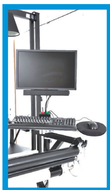
Computer monitor and keyboard stand

DES Sanayi Sitesi 1. Cadde D-3 Blok No:27 34776 Dudullu Istanbul